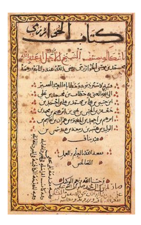
Figure 7: Title page of a copy of The Compendious Book on Calculation by Restoration and Balancing.

Al-Khwarizmi's book on the solution of linear and quadratic equations is regarded as the foundation and the cornerstone of this branch of mathematics, eventually granting him the grand title of Father of Algebra. al-Kitāb al-Mukhtasar fī Hisāb al-Jabr wal-Muqābalah, 'The Compendious Book on Calculation by Restoration and Balancing', was the treatise that cemented algebra as a discipline in its own right, collating various different algebraic methods to form algorithmic approaches to a wide range of problems.