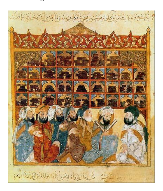
Figure 2: Depiction of an Arabic manuscript library. Maqamat of al-Hariri Illustration by Yahyá al-Wasiti, Baghdad 1237 Bibliothèque nationale de France, MS Arabe 5847 .

expanded to a public institute under his half-brother and successor Abu al-Abbas Abdallah ibn Harun al-Rashid (c. 813-833 CE).<sup>3</sup> This unique background created the perfect conditions for a new kind of mathematics to be formed that was more than a mere amalgamation of ancient traditions.