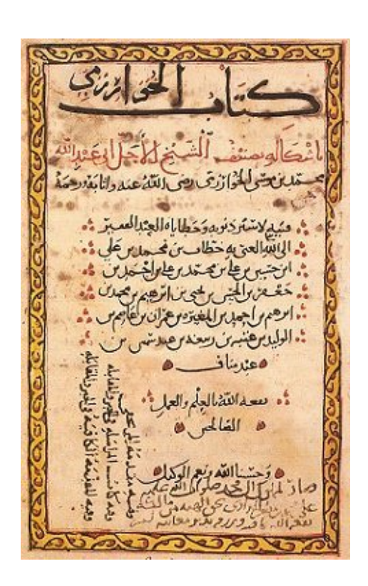
Figure 1: Title cover of a copy of al-Khwarizmi's Compendious\ Book\ on\ Calculation\ on\ Restoration\ and\ Balancing.

Samy Benaferi for the University of Oxford {\bf August~2021}