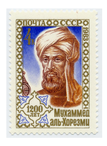
Figure 4: An imaginary portrait for al-Khwarizmi derived from a soviet stamp.

Brought up as a Zoroastrian, many historians believe that he subsequently converted to Islam. In his pioneering work, al-Kitāb al-Mukhtasar fī Hisāb al-Jabr wal-Muqābalah, 'The Compendious Book on Calculation and Restoration', he opens with the line 'Bism-Illāh al-Rahmān al-Rahīm' ('In the name of God, the most Gracious and Compassionate'), the phrase recited before the reading of the Quran with which a great amount of books written by devout Muslims begin, even to this day.