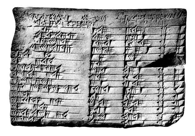
Figure 5: Plimpton 322 is a Babylonian clay tablet, notable as containing an example of Babylonian mathematics. It has number 322 in the G.A. Plimpton Collection at Columbia University.

The Babylonians relied on a positional sexagesimal system (system of base 60) in contrast of our modern decimal system of base 10. The fact that we divide hours into 60 minutes and minutes into 60 seconds is due to the mathematics of Mesopotamian civilisations. A common theory for why this was states that the Sumerians were a product of a merging of two earlier peoples with number systems of bases 5 and 12, creating a common system on 60 for mutual understanding, however this might not be the case since the Babylonians relied on a system of six groups of ten, not five groups of twelve. Although from our perspective, this system is an over-complication from our simple modern system of base 10, the Babylonians made no consistent use of zero in their mathematics.