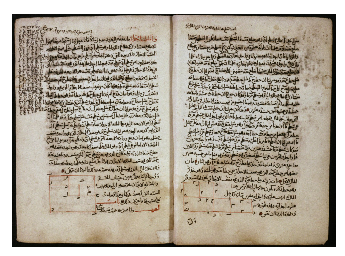
Figure 8: A page from a copy of 'The Compendious Book on Calculation by Restoration and Balancing' showing a geometric justification.

In the second section of his book, propositions from Book II of Euclid's Elements are used in order to accompany his algorithms with geometric examples. Al-Khwarizmi was in fact the first to make this geometric justification for the solution of the quadratic from these elementary propositions.